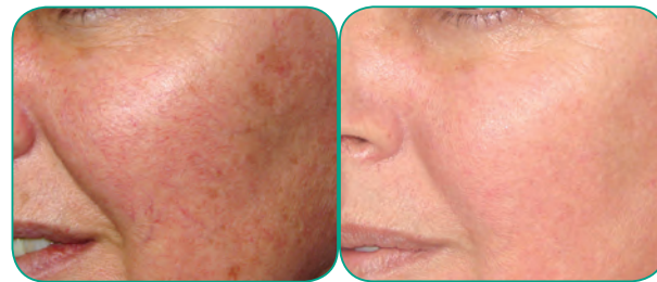
BEFORE | AFTER 4 IPL treatments

Little red lines (broken capillaries) that appear on the nose and cheeks are commonly found in fair, thin-skinned people or as a result of environmental exposure to sun and wind. Broken capillaries, along with chronic redness and flushing, are also characteristic of individuals with facial rosacea. Lumenis IPL addresses both problems, eliminating broken capillaries and inflammation without disturbing healthy tissue or surrounding normal blood vessels, leaving clear, even-toned skin.