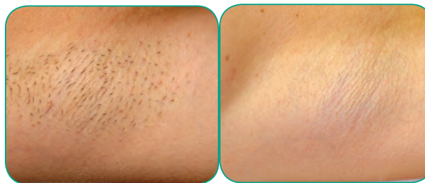
BEFORE | AFTER 6 IPL treatments

Unwanted hair on the face, back, legs, bikini line, or any other body area has a simple and long-lasting solution. Lumenis IPL uses specific energy settings matched to your skin, hair type, and location to ensure treatments are uniquely tailored and extremely effective. Highly controlled light flashes are absorbed by hair follicles, damaging or destroying their regrowth potential without affecting surrounding skin.