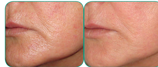
BEFORE | AFTER 3 IPL treatments

Lumenis IPL produces younger-looking skin by using light energy to repair damaged tissue in a process called photofacial. Imperfections created by sun exposure, such as pigmented spots and broken blood vessels, are noticeably improved after only a few treatments. In addition, IPL stimulates collagen growth in the deep dermal layers, helping to restore volume and elasticity to the skin's support system. Fine lines and wrinkles are diminished, pore size is reduced, and the dull skin that can come with age gains a brighter, more youthful appearance.