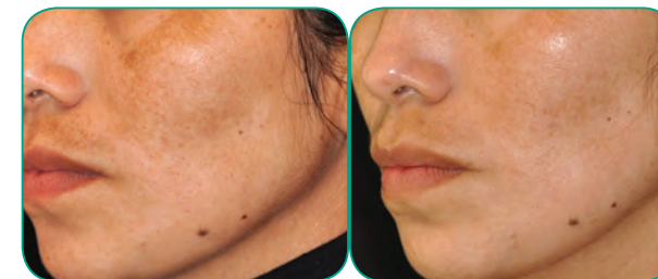
BEFORE | AFTER 2 IPL treatments

Triggered by sun exposure, genetics, and hormone changes, melasma is a condition that causes brown discoloration of the face. By delivering broadband light in highly focused pulses, Lumenis IPL specifically targets the darker-pigmented patches of skin, causing the discolored areas to fade without any damage to surrounding skin. IPL tends to work best in conjunction with your practitioner's recommendations for prescribed topical skin bleaching.