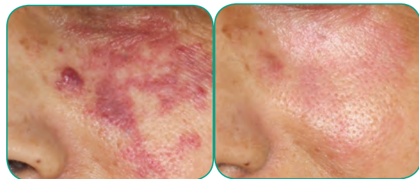
BEFORE | AFTER 4 IPL treatments

IPL represents a new freedom from unwanted birthmarks that completely avoids the complications of traditional options like injected steroids, surgery or freezing. Lumenis birthmark treatment is highly effective, using laser and IPL to close off different-sized blood vessels at varying depths in the skin. Lumenis IPL is so low trauma, it is gentle enough for children. Complicated birthmarks can be treated with pinpoint accuracy, restoring an even skin tone quickly and with little discomfort.