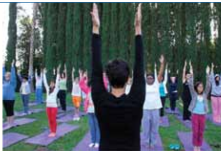
Angel Faces retreat participants partake in Yoga class