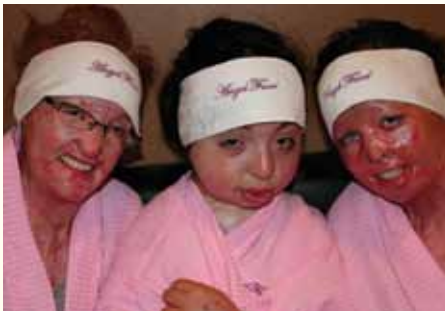
Angel Faces retreat participants enjoy a day at the spa

treatment of adult patients, it is only a small portion of our operating budget given that our practitioners treat hundreds of children for free," she said. "We would not be able to pay the market price to maintain the device. Therefore, the pledge of continued support is even more important as it will enable us to continue to provide state-of-the-art, safe and free treatment for Vietnamese children with disfiguring burn and/or traumatic scars. VAC was originally focused on treating hemangiomas and pigmented lesions, but with the advent of fractional technology, we realized there is also a great opportunity to treat burn victims."