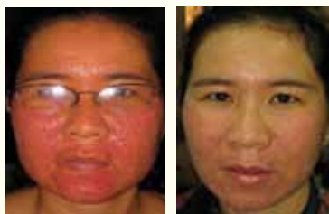
Acne scars before Tx Acne scars after UltraPulse Tx